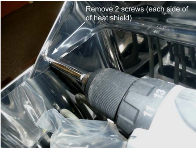
Remove 2 screws (each side of heat shield)