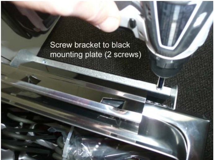
Screw bracket to black mounting plate (2 screws)