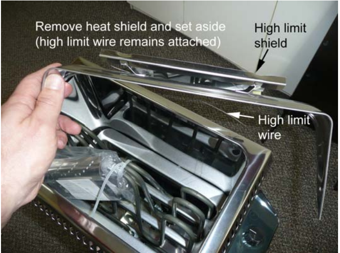
Remove heat shield and set aside (high limit wire remains attached)