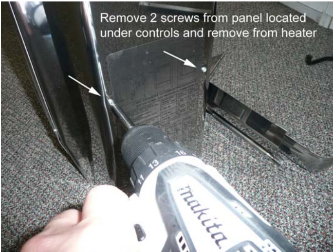
Remove 2 screws from panel located under controls and remove from heater