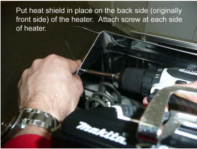
Put heat shield in place on the back side (originally front side) of the heater. Attach screw at each side of heater.