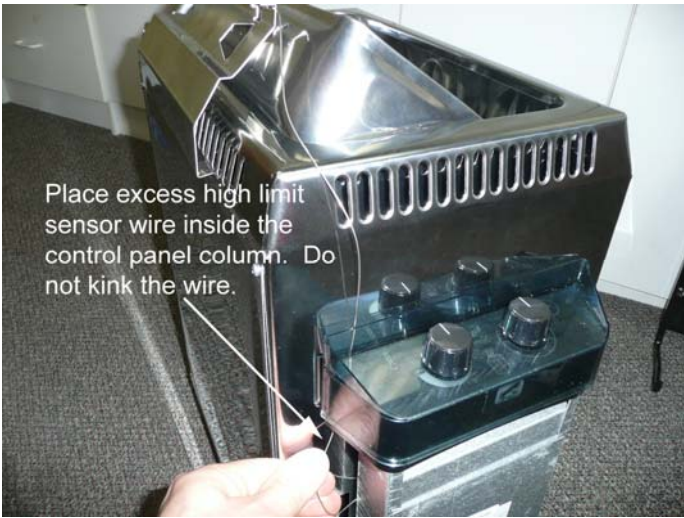
Place excess high limit sensor wire inside the control panel column. Do not kink the wire.