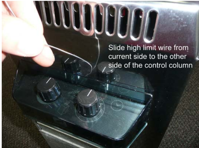
Slide high limit wire from current side to the other side of the control column