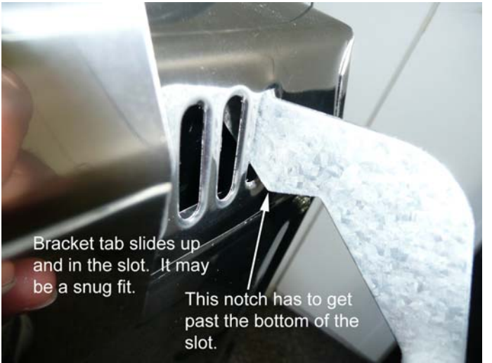
Bracket tab slides up and in the slot. It may be a snug fit.