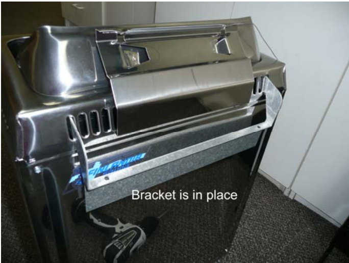
Bracket is in place