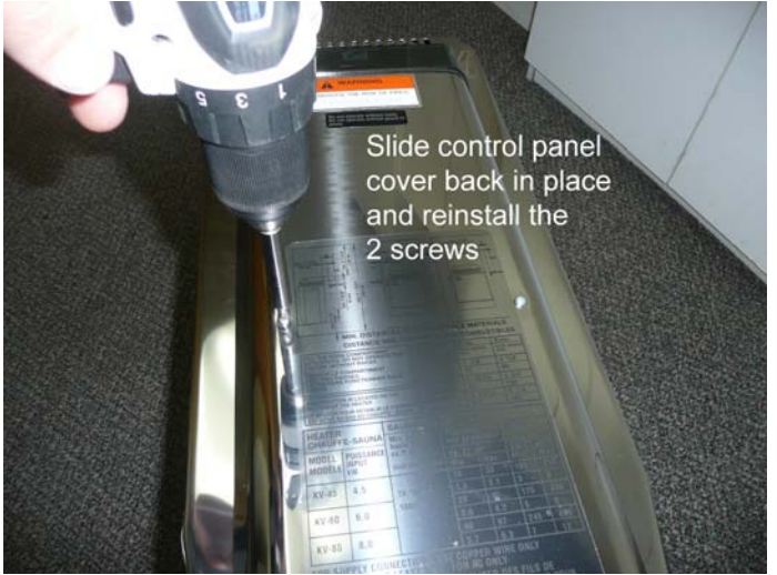
Slide control panel cover back in place and reinstall the 2 screws