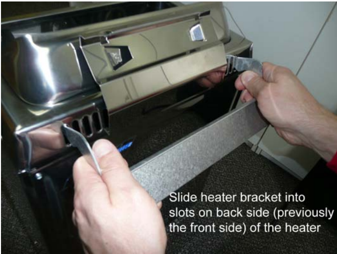
Slide heater bracket into slots on back side (previously the front side) of the heater